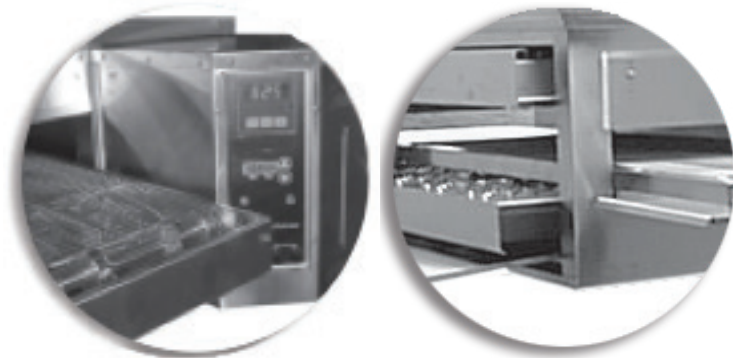
Removable panels for easy cleaning