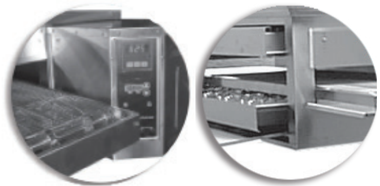
Removable panels for easy cleaning