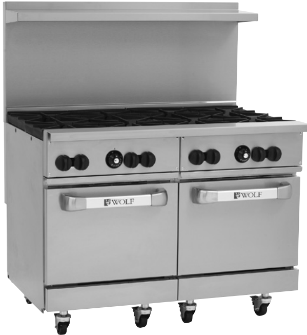
Model C48SS-8BN (shown with optional casters)