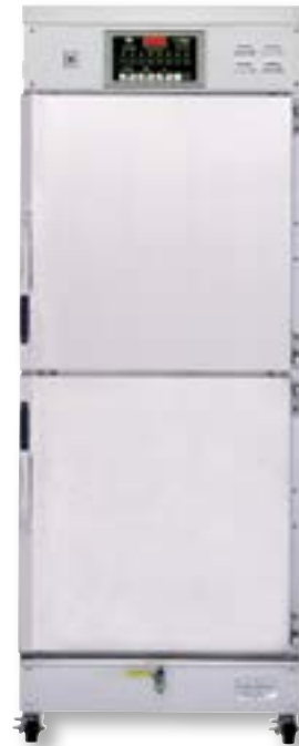
CA8522 CVAP® THERMALIZER OVEN FULL SIZE MODEL WITH FAN 8 Channel Programmable Control

CVap equipment complies with domestic and international requirements such as UL, C-UL, UL Sanitation, CE, MEA, and others.