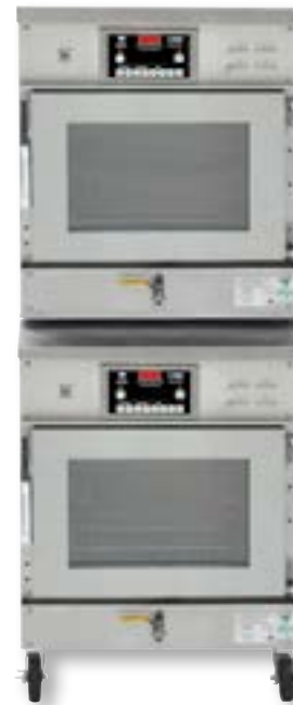
CAC507 CVAP® COOK & HOLD OVEN HALF SIZE STACKED MODELS WITH FANS 8000 Series Electronic Controls

CVap equipment complies with domestic and international requirements such as UL, C-UL, UL Sanitation, CE, MEA, and others.