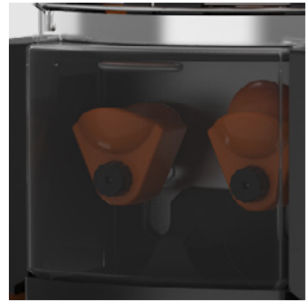
Smoky grey front cover