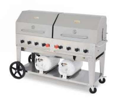
CCB-60 shown with two optional RD-30 Hoods/Domes