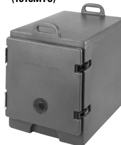
For Camcarriers (300MPC)