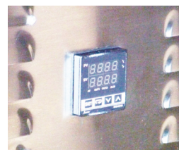
Digital Electronic Controller (Electric Models)