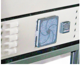
Digital Electronic Controller