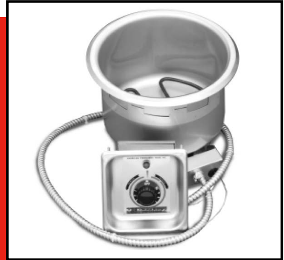
Top Mount Round Well w/ Immersible Element