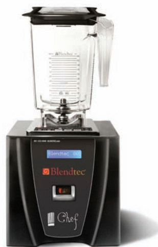
No Sound Enclosure