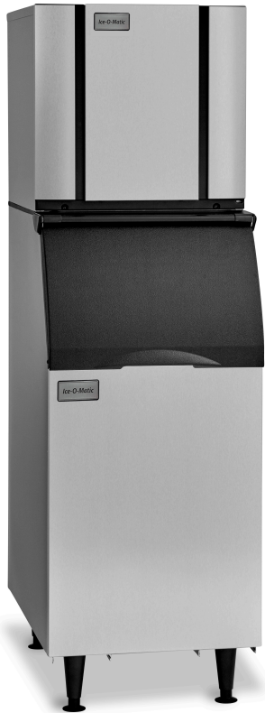
CIM0520 ON B42