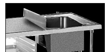
NSF Partition 5" TA-56A $369 18" NSF Partition TA-92 $135 lin. ft. 12" Apron

Call For Installation of Buyout Equipment!