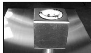
TA-112 $470 Hubble Outlet