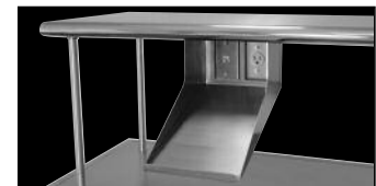
PRT-1 $663 Printer Shelf with Data Port & Electrical Outlet