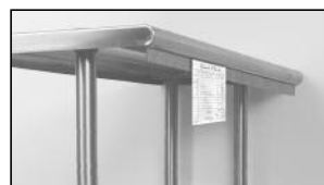
TA-77 $45 lin. ft. Check Minder Shelf Provision