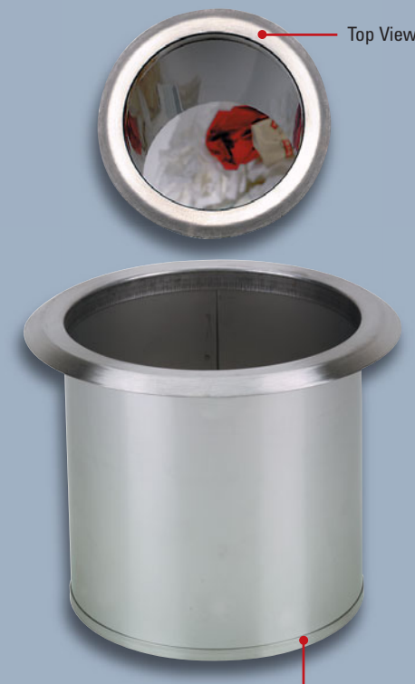
TCD-2NB Hemmed bottom, no sharp edges