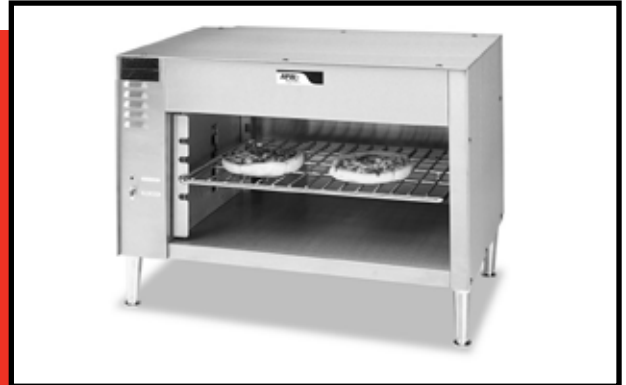
MODEL CDC-24 SHOWN