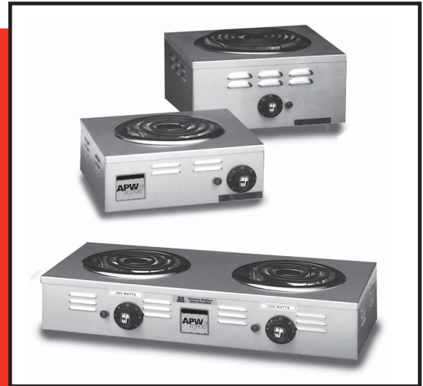
Models: CHP-1A, CP-1A, CP-2A