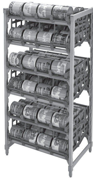
CPU243672C96 Premium Unit (with Cans)