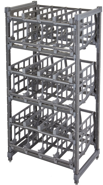
ESU243672C96 Elements Unit (Empty)