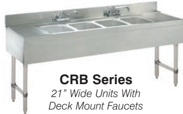
CRB Series 21" Wide Units With Deck Mount Faucets