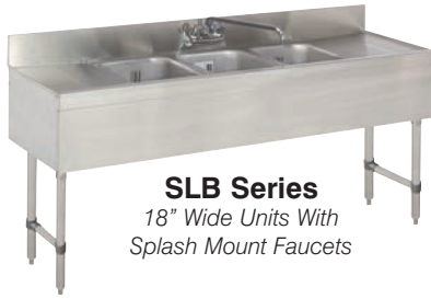
SLB Series 18" Wide Units With Splash Mount Faucets