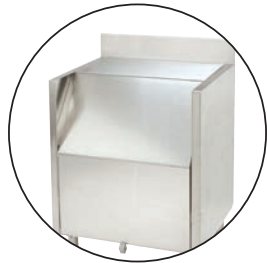
Optional Locking Cover Available - Includes Padlock & 2 Keys