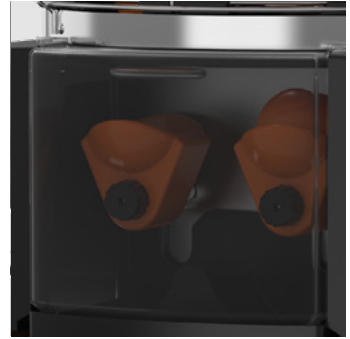
Smoky grey front cover