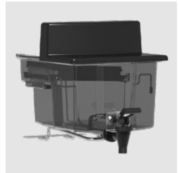
1 gallon reservoir