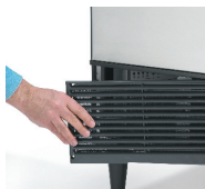
Front Air Filter