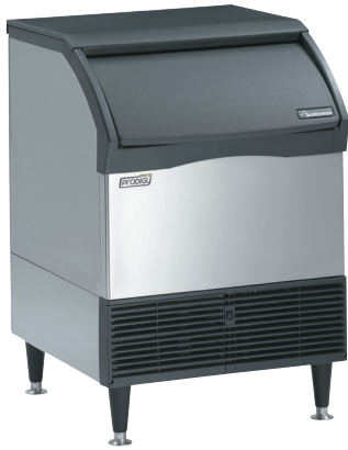
CU1526 / CU2026