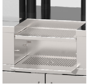
Removable drip tray