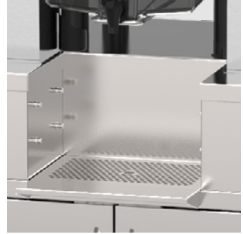
Removable drip tray