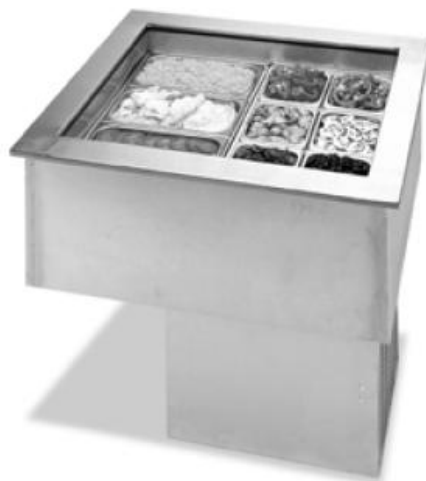
Model: Drop-In Cold Well