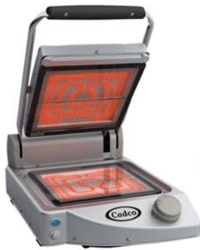
CPG-10FC(120 & 220)