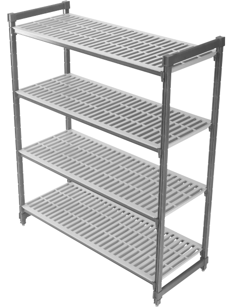
Four Shelf Unit with Vented Shelf Plates.