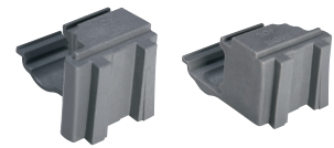
Set of Left and Right Corner Connectors (1 set required per shelf).