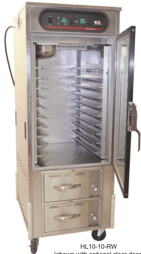
HL10-10-RW (shown with optional clear door)

TEMPERATURE & HUMIDITY CONTROL... Individual dial controls on each drawer for temperature and adjustable front vents to control humidity, allowing food to be hot and crispy in one drawer, warm and moist in another. Temperature range of 90°F to 210°F (32°C-99°C).