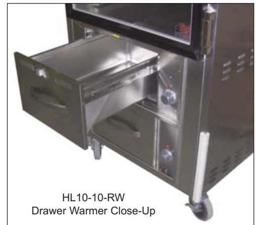
HL10-10-RW Drawer Warmer Close-Up