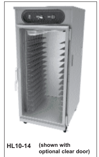
HL10-14 (shown with optional clear door)