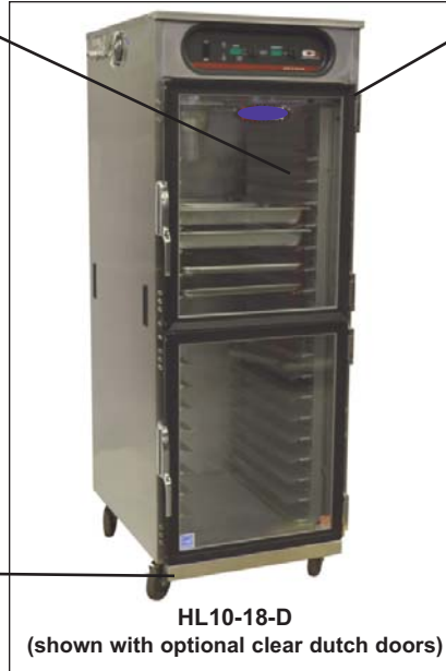
HL10-18-D (shown with optional clear dutch doors)

STAINLESS STEEL DRIP TROUGH... Located at base of door to catch condensation. Easy to remove sliding keyhole design for emptying and cleaning.