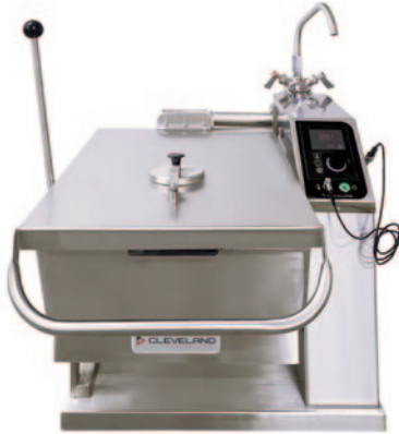
Shown with optional Double Pantry Faucet (DPK24)