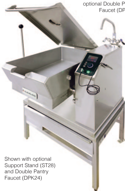
Shown with optional Support Stand (ST28) and Double Pantry Faucet (DPK24)