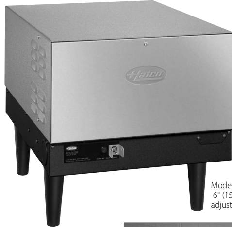
Model C-45 with 6" (152 mm) adjustable legs