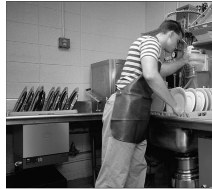
Water Temperature Recovery Table