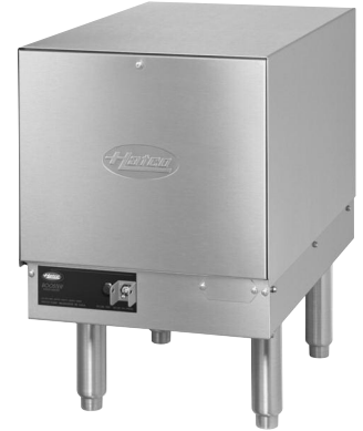
Model C-18 with optional 6" (152 mm) stainless steel adjustable legs