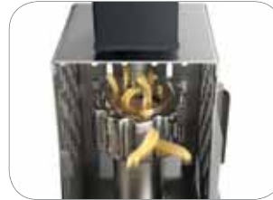
Pasta Cutter Accessory