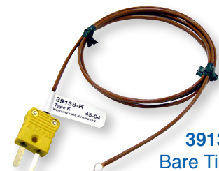
39138-K Bare Tip Probe