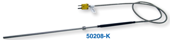
50208-K Fry Vat Probe