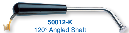
50012-K 120° Angled Shaft Surface Bell Probe