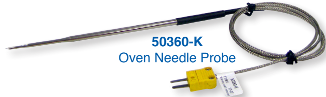
50360-K Oven Needle Probe