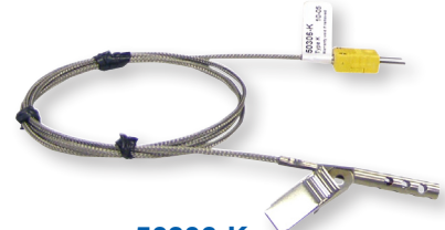
50306-K Oven / Freezer Probe