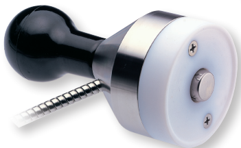
50014-K Weighted Griddle Surface Probe