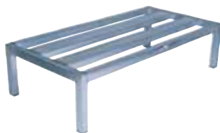
ALCH Series Tubular frame with 4" E-Channels.

Against Rust or Corrosion on All Aluminum Products.