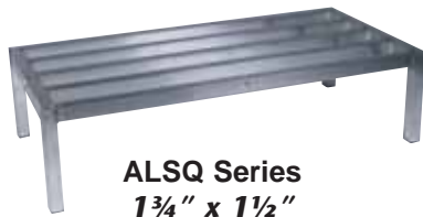
ALSQ Series 1 3/4" x 1 1/2" Tubular Frame