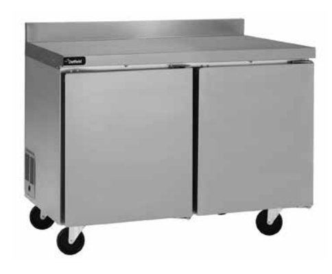
GUF60BP-S Shown with optional hinging