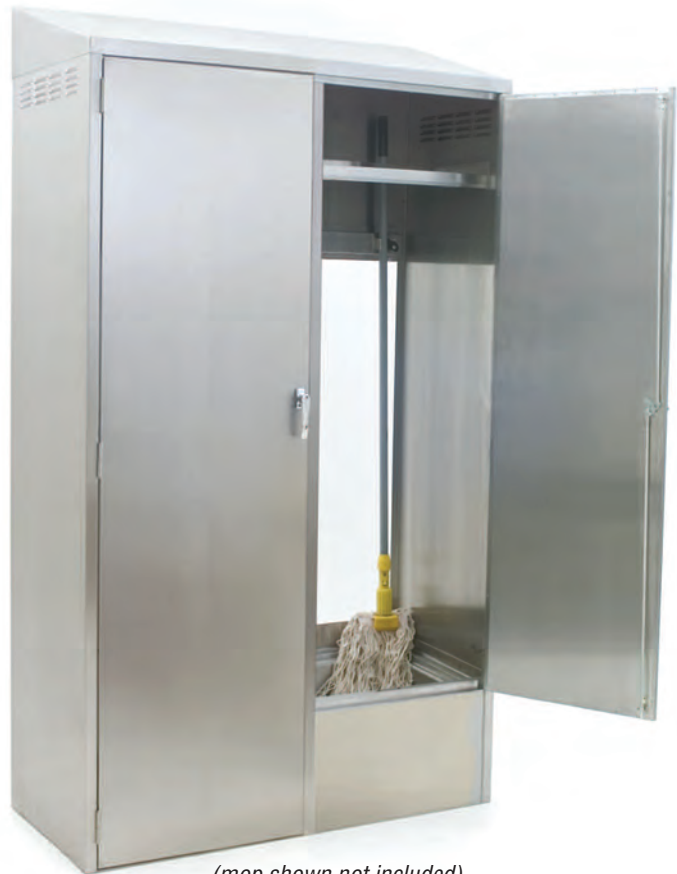
(mop shown not included)

The new Double-Width Mop Sink Cabinets is the perfect storage unit for all of your cleaning supplies and equipment. One side features three intermediate shelves for storage, and the other side features an overhead shelf, two-pole mop holder and a 16" x 20" x 8"-deep mop sink with drain. The 84" height allows for plenty of space to store all of your cleaning supplies, mops, and mobile mop bucket. Other features include louvers along the top of each side panel for ventilation, and a sloped top for ease of cleaning. Available with mop sink on the left- or right-hand side.