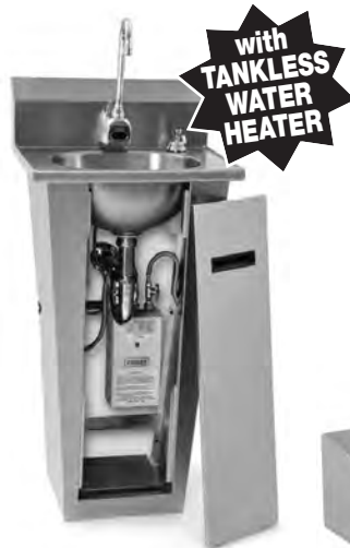
hand sink with hot water heater