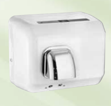
DR-TN Series White