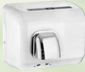
DR-TN Series White Automatic