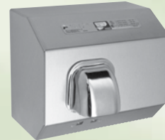
DR-TNSS Stainless Steel Automatic

THE DR SERIES HAND DRYERS' TIME-TESTED DESIGN FEATURES QUIET, DEPENDABLE OPERATION IN A HEAVY DUTY, VANDAL-RESISTANT PACKAGE.