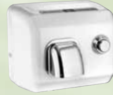
DR-N Series White Push Button