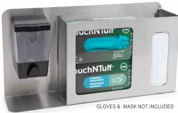
GLOVES & MASK NOT INCLUDED