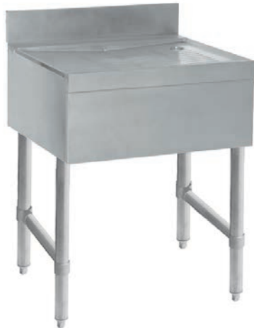
CRD Series 21" Wide Units