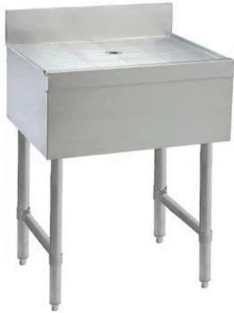
SLD Series 18" Wide Units