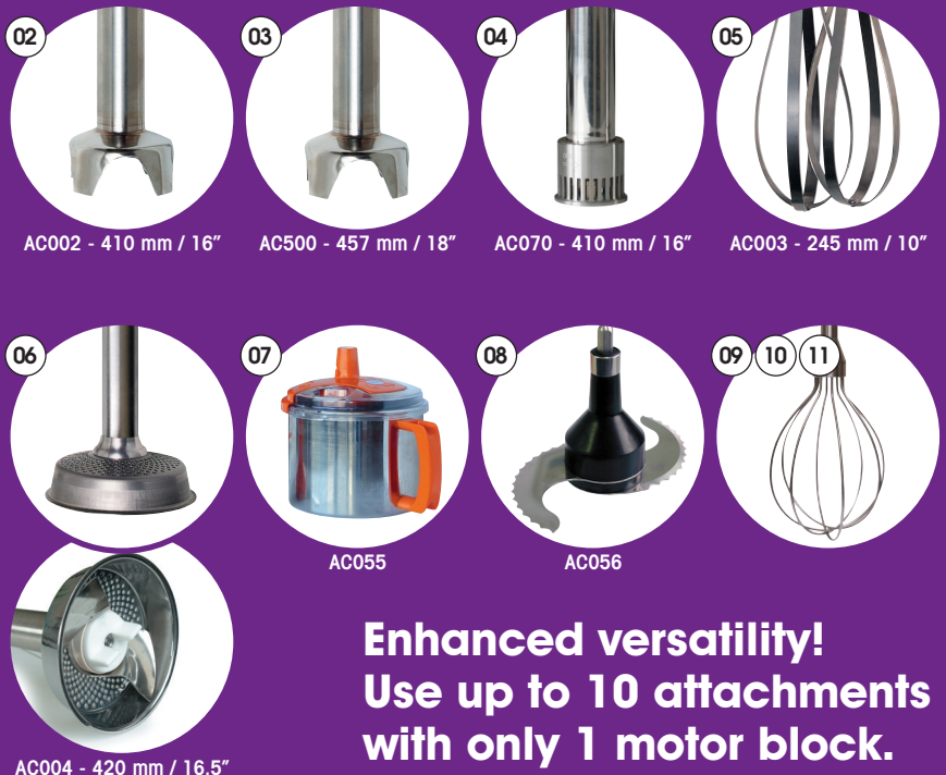
AC002 - 410 mm / 16"