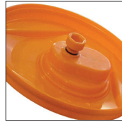
SD92SC Sealed Cover Lid