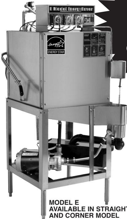
MODEL E AVAILABLE IN STRAIGHT AND CORNER MODEL

USES ONLY .93 Gallons Of Water Per Cycle!