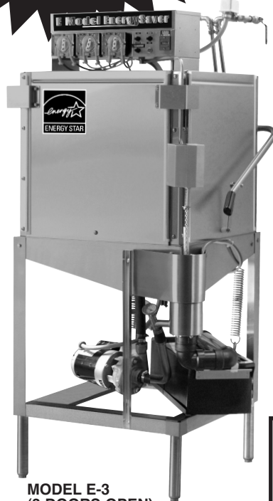
MODEL E-3 (3 DOORS OPEN) AVAILABLE FOR STRAIGHT THROUGH AND CORNER OPERATION.