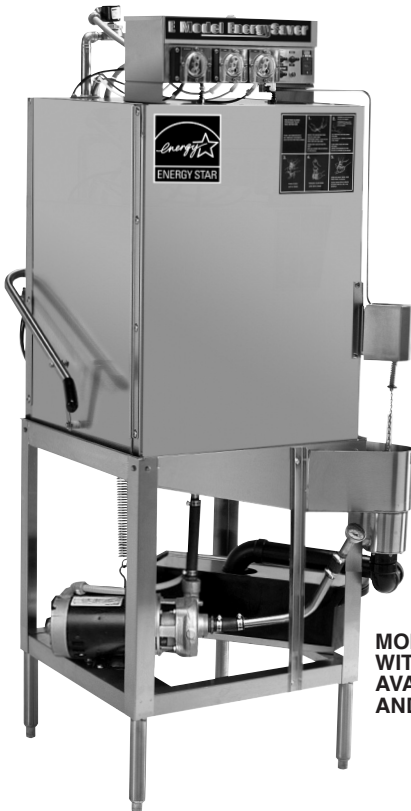
MODEL E EXT WITH 20-1/2" DOOR OPENING AVAILABLE IN STRAIGHT AND CORNER MODEL