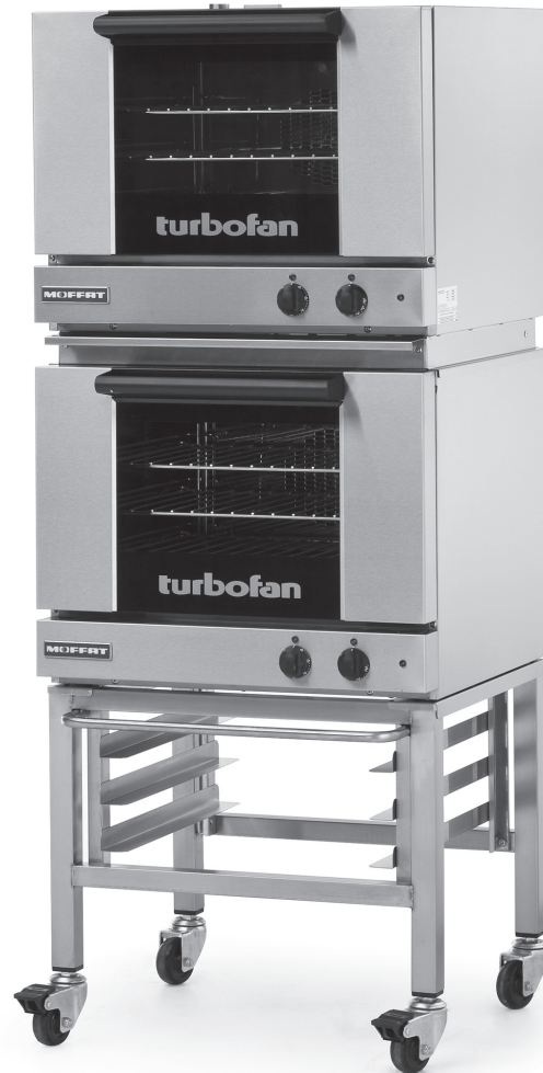
Model E22M3/2C shown