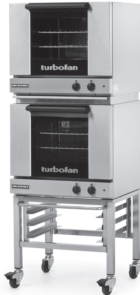
Model E23M3/2C shown