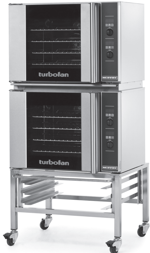
Model E31D4/2C shown