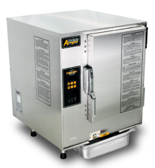
E6 Evolution Model shown with optional drain pan and bullet feet

Evolution steamer is AccuTemp Products' connectionless, boilerless steam cooker that utilizes AccuTemp's Patent Pending Steam Vector Technology for faster cook times, improved energy efficiency, better pan to pan uniformity. Steam Vector Technology requires no moving parts inside the cooking chamber. Steam to be produced inside the cooking cavity with no heating element exposed to water. No water or drain line. Unit to include low water, high water, overtemp warning lights and auto shut off feature. Evolution to include heavy duty, field reversible door. Standard digital controls with independent timer. No water quality exclusions to warranty and no water filtration or treatment required. Unit to be UL Safety and Sanitation Certified, and Energy Star qualified. Built in USA.