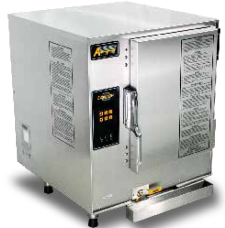
E6 Evolution Model shown with optional bullet feet

Evolution steamer is AccuTemp Products' connected, boilerless steam cooker that utilizes AccuTemp's Patent Pending Steam Vector Technology for faster cook times, improved energy efficiency, better pan to pan uniformity, and less water consumption. Steam Vector Technology requires no moving parts inside the cooking chamber. Steam to be produced inside the cooking cavity with no heating element exposed to water. Easily connects to water and drain line. Uses less than 1.5 gallons of water per hour. Unit to include low water, high water, overtemp warning lights and auto shut off feature. Evolution to include heavy duty, field reversible door. Standard digital controls with independent timer. No water quality exclusions to warranty and no water filtration or treatment required. Unit to be UL Safety and Sanitation Certified, and Energy Star qualified. Built in USA.