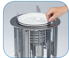
Adjust-A-Fit® Diameter Adjustment