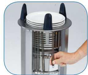
Spring Tension Adjustment